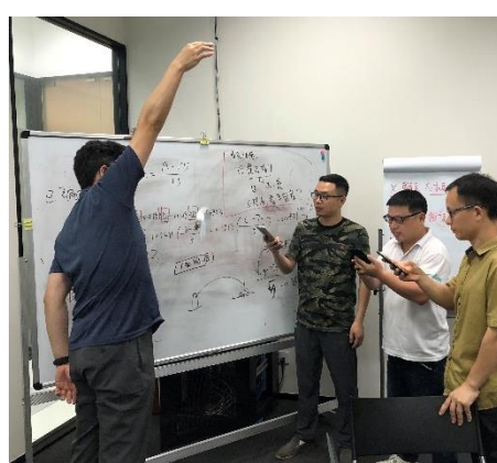
FORD DFSS Training