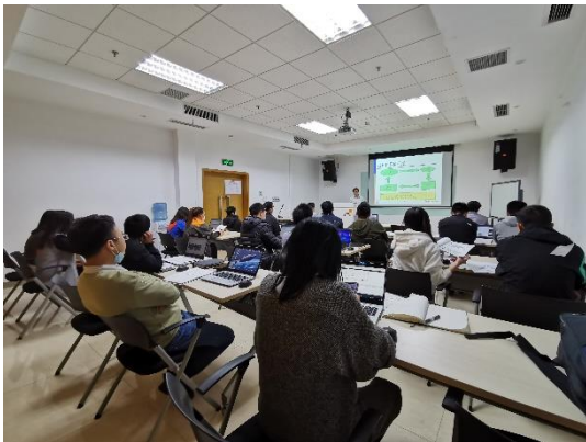
Continental Huayu SSI