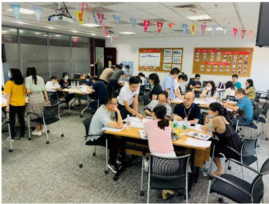
Wuhan Lenovo FMEA Workshop