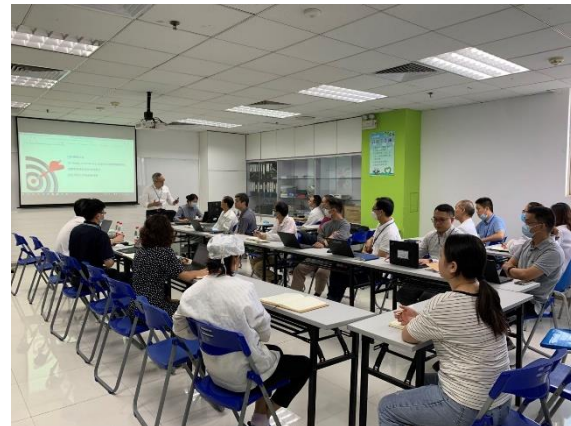
Lean Six Sigma Training