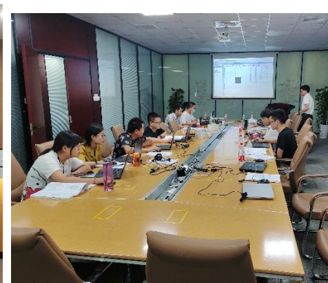
Ningbo Zhenyu Lean Six Sigma Training