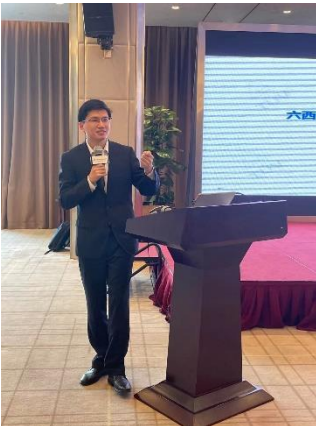
Lean Six Sigma Seminar