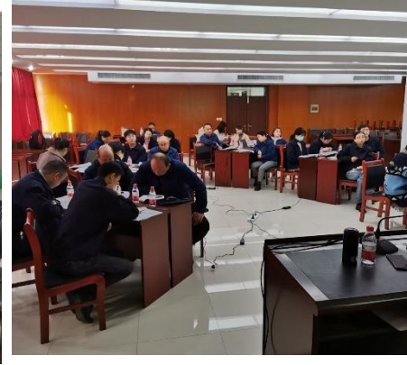
DAZHI PAPER MACHINERY Big Data