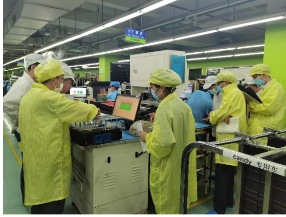
VTECH Industry 4.0 Assessment