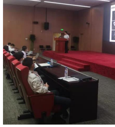
FAW Hongqi FMA