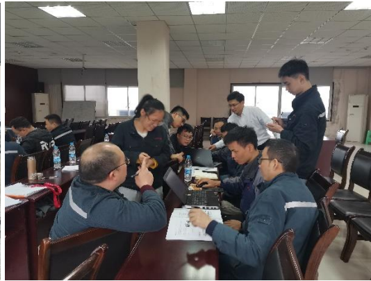
Chongqing Sanyou PFMEA Workshop