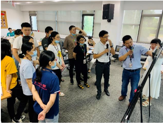
Lenovo Five Quality Tools Training and Coach