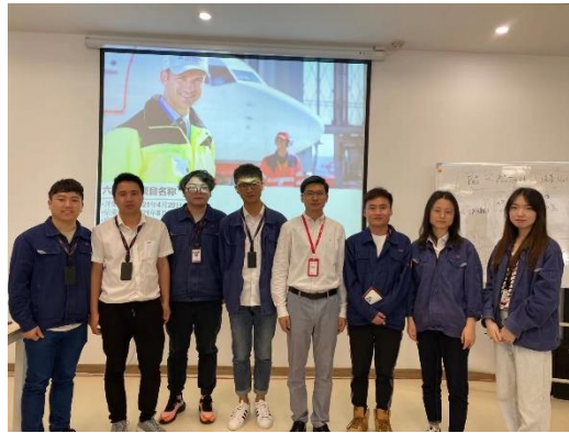
Mianyang HKC Lean Six Sigma Coaching