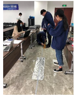
Chuzhou HKC DOE