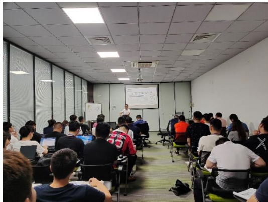
Ningbo Zhenyu PFMEA Workshop