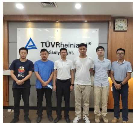
ADIENT QFD Training