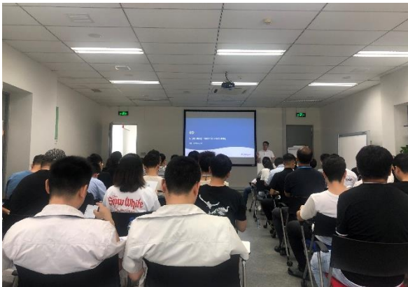
Bosch G8D Training