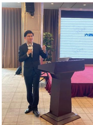
精益六西格玛研讨会