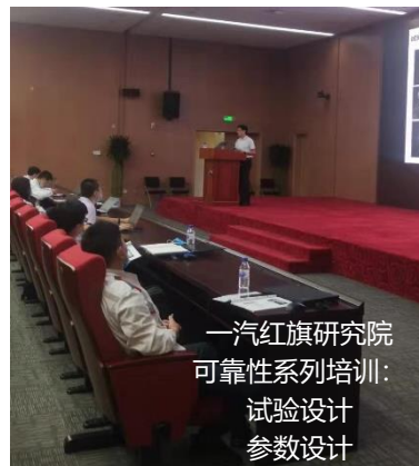
一汽红旗研究院 可靠性系列培训： 试验设计 参数设计 容差设计 特殊特性识别与传递 FMA工程与技术